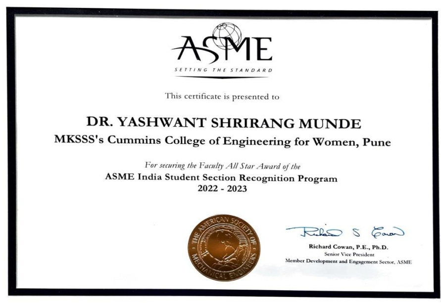
American Society of Mechanical Engineers