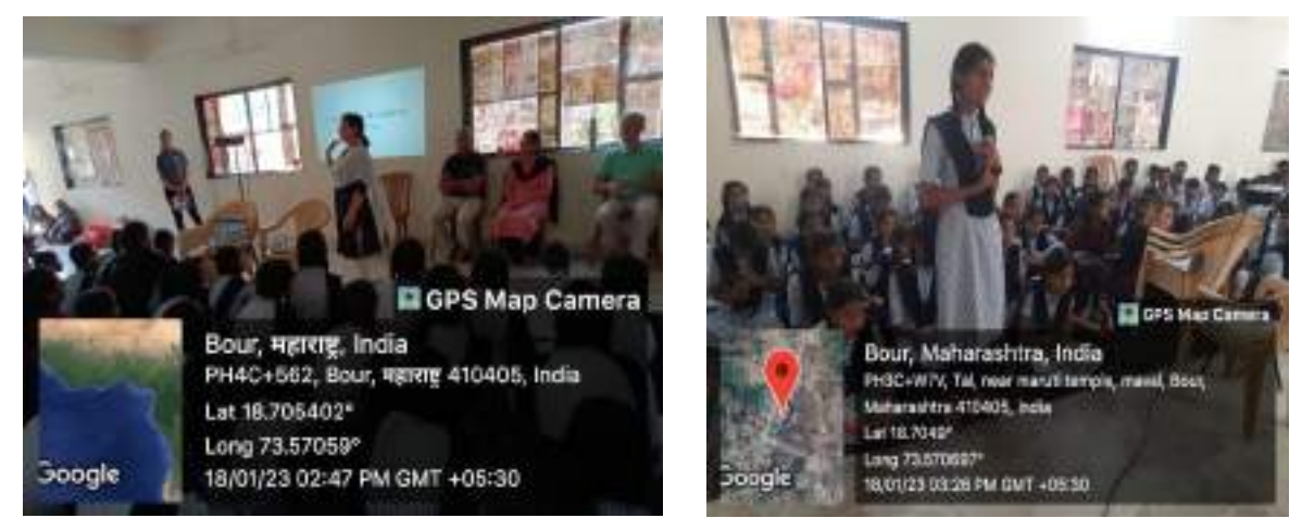
Importance of a Healthy and Balanced Diet