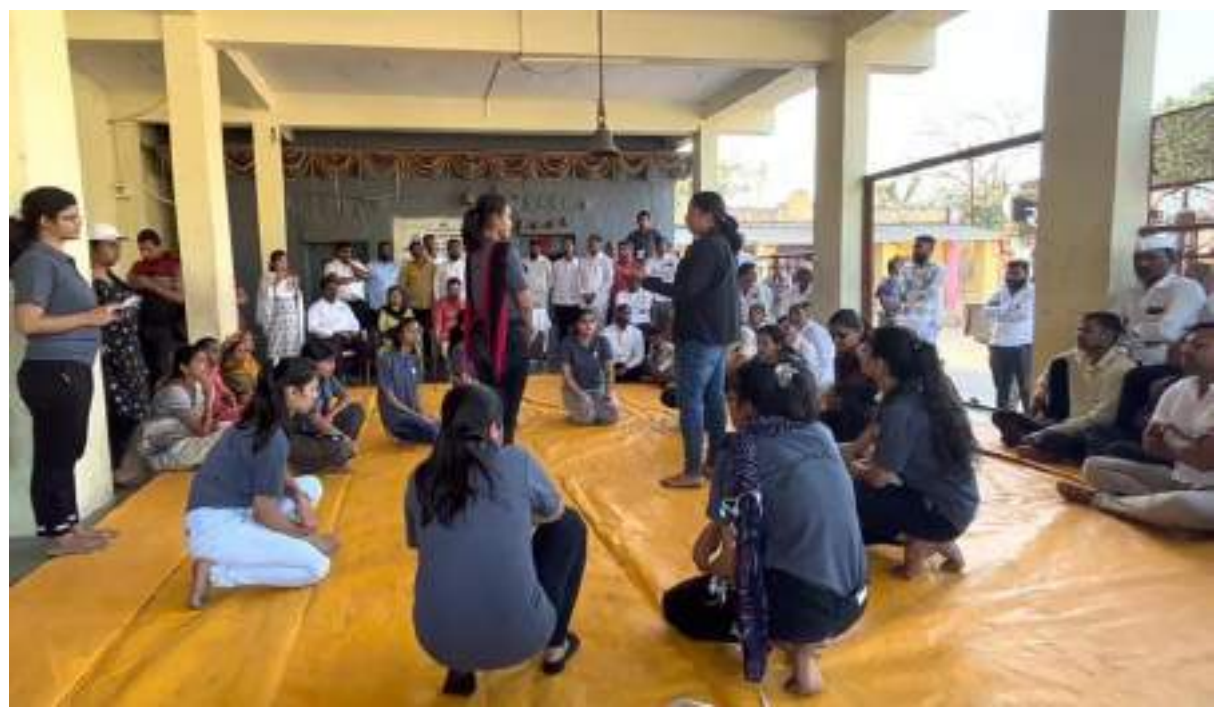
Street play on women's education and abolition of child-marriage by NSS volunteers