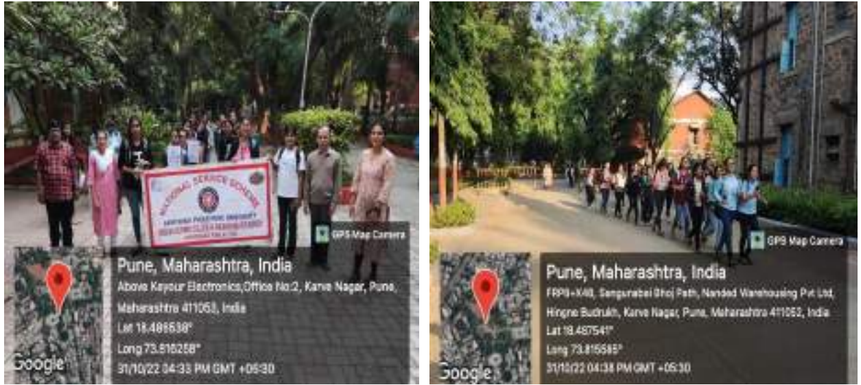
Run for Unity on occasion of National Unity Day 2022 by Cummins College, Pune

MKSSS'S Cummins College, Pune celebrated National Unity Day 2022 by taking pledge