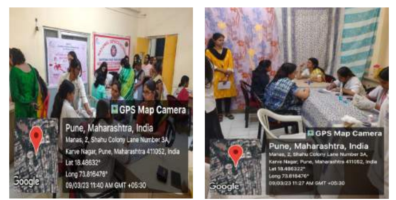
Faculty and students at Health check-up camp in MKSSS'S Cummins College, Pune