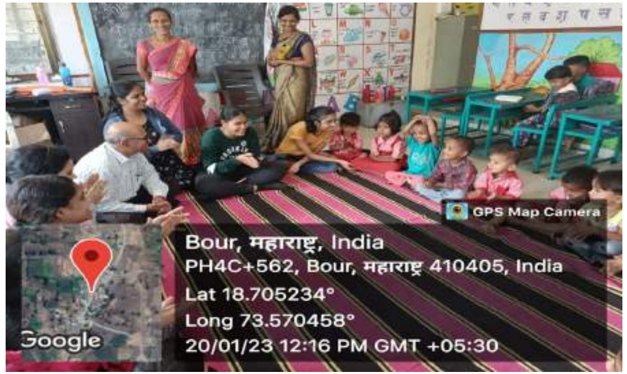
Fun activity for Anganwadi school Children