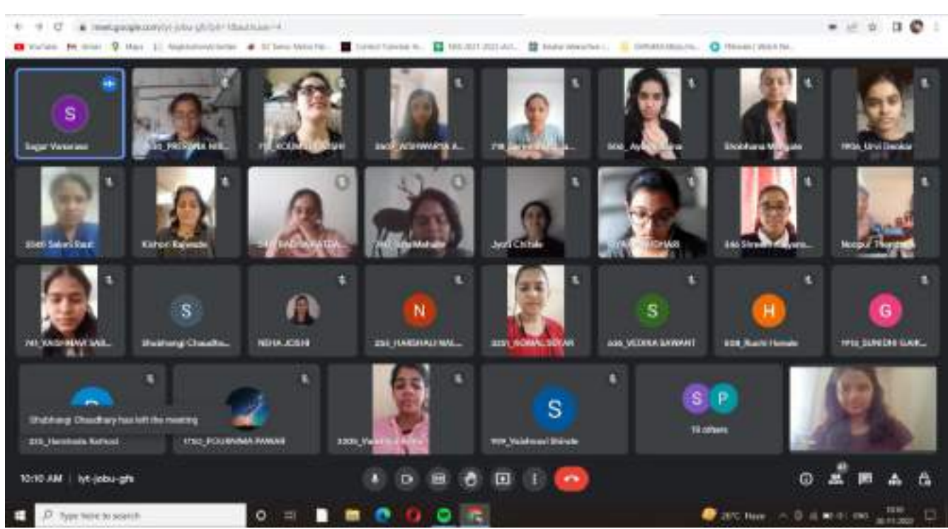
Constitution Day 2022 Celebration by MKSSS'S Cummins College of Engineering, Pune