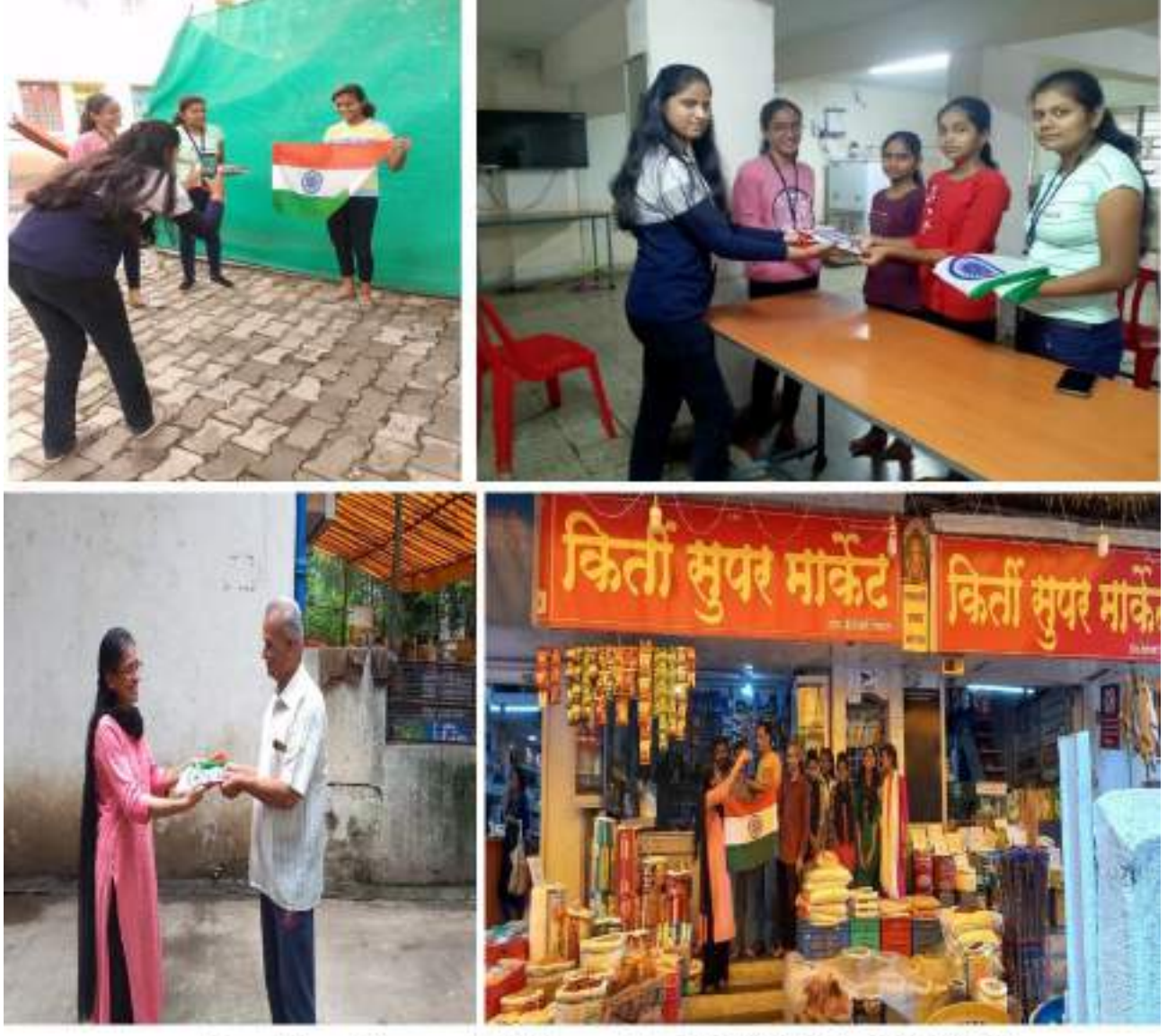
Har Ghar Tiranga Activity on date 06/08/2022 to 14/08/2022

We participated in this Guinness World Records spearheaded by Savitribai Phule Pune University (SPPU), for the 'Largest Online Photo Album of People Holding a National Flag'. Photo with national flag uploaded on the SPPU link: <u>https://spputiranga.in/photoupload/</u> by all students, staff and citizens nearby college.