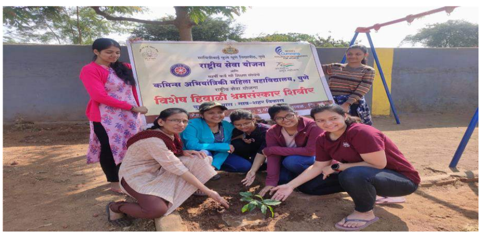
Tree Plantation Activity at Zilla Parishad School, Baur