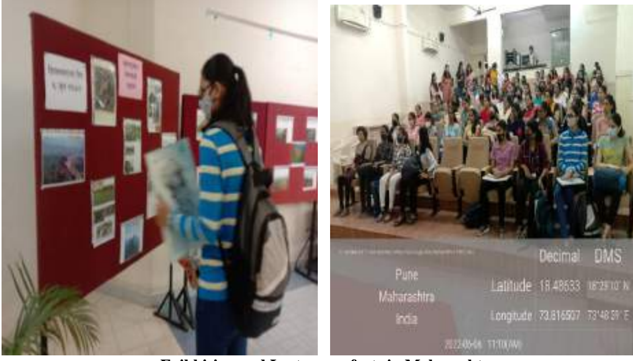
Exibhision and Lecture on forts in Maharashtra