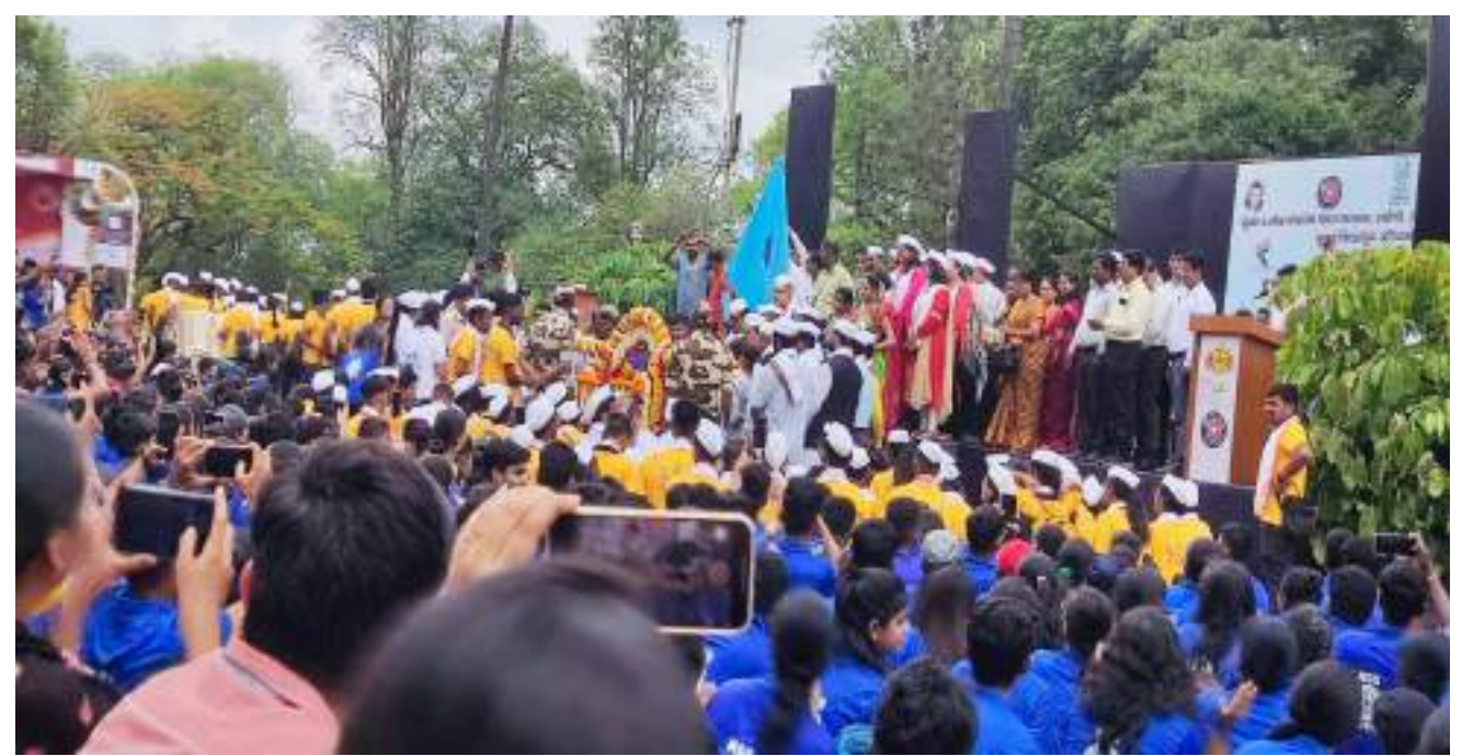
Cummins NSS Team joined the NSS Vari program at Pune University on 23rd June 2022

On 24<sup>th</sup> June 2022 our NSS Team conducted Cleanliness Drive in Bhairavnath mandir where Warkari Dindya had come. We collected the garbage in bags also volunteers sweep the mandir area. NSS PO took efforts along with the volunteers to arrange this activity successfully. Local people appreciated this activity. The mandir area and its surroundings were cleaned during this drive.