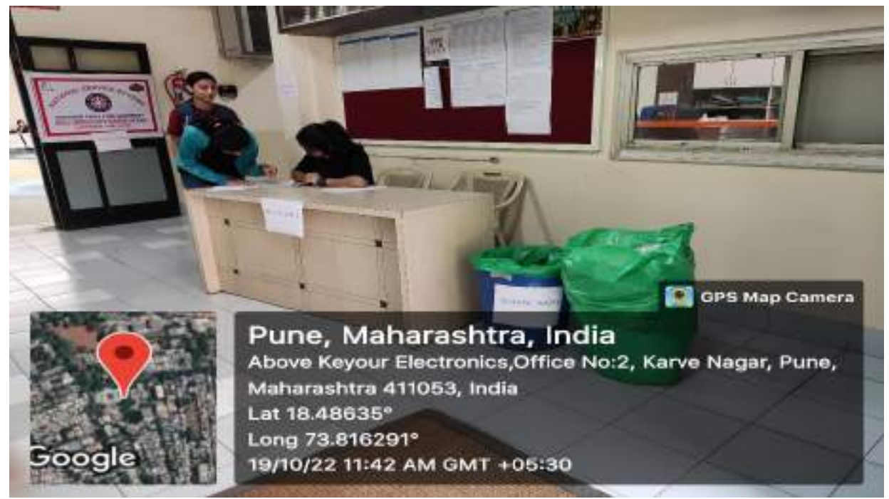
Plastic Collection Drive by MKSSS'S Cummins College of Engineering, Pune

This drive aims to achieve a target and sustain the spirit that we are always at peak on Nation Building Activities.