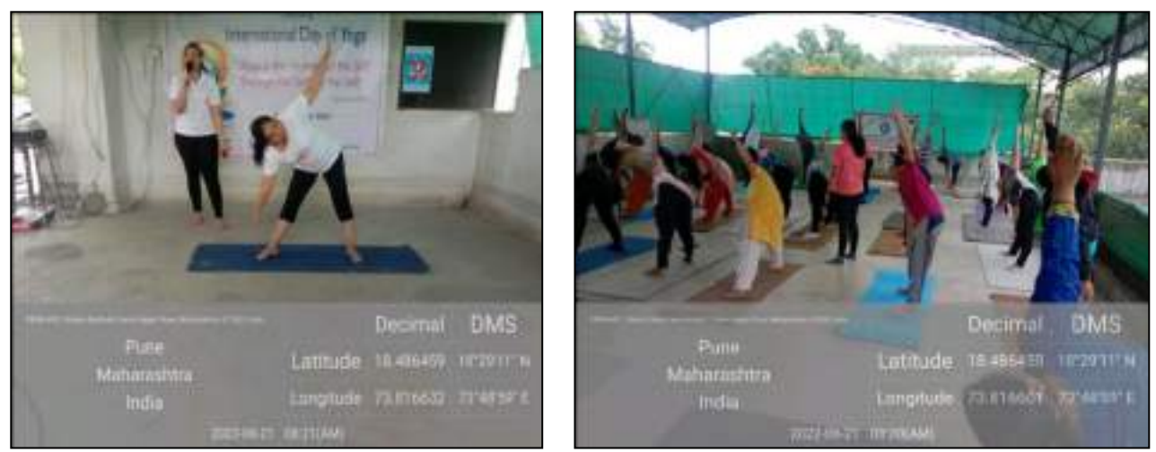
International Yoga Day 2022-23 Photos