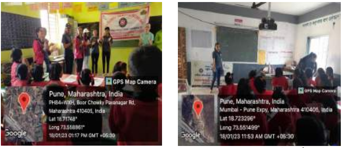
NSS volunteers taking study activity for school students 1<sup>st</sup> to 7<sup>th</sup> standard