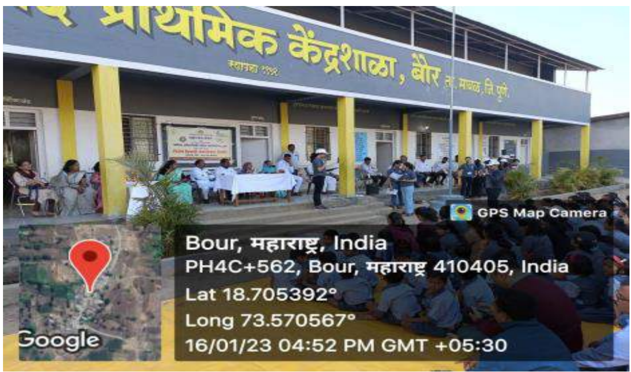
Inauguration of NSS Camp of MKSSS's Cummins College of Engineering for women, Pune