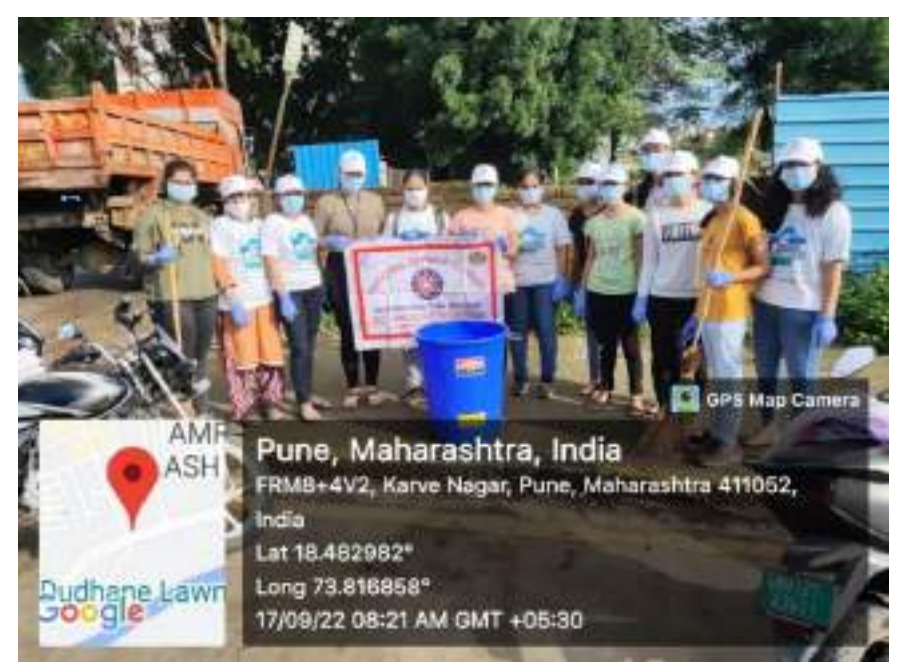
NSS Team of MKSSS'S Cummins College, Pune during Swachh Amrit Mahotsav