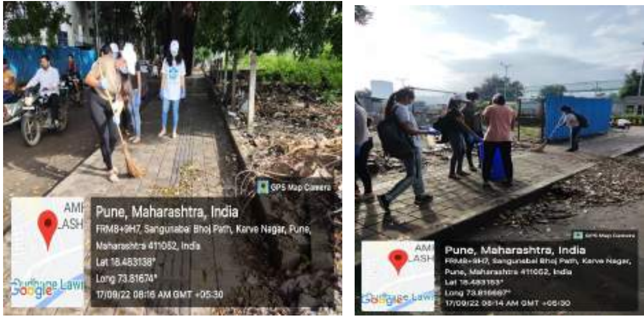
NSS Team of MKSSS'S Cummins College, Pune doing road cleaning during Swachh Amrit Mahotsav 2022