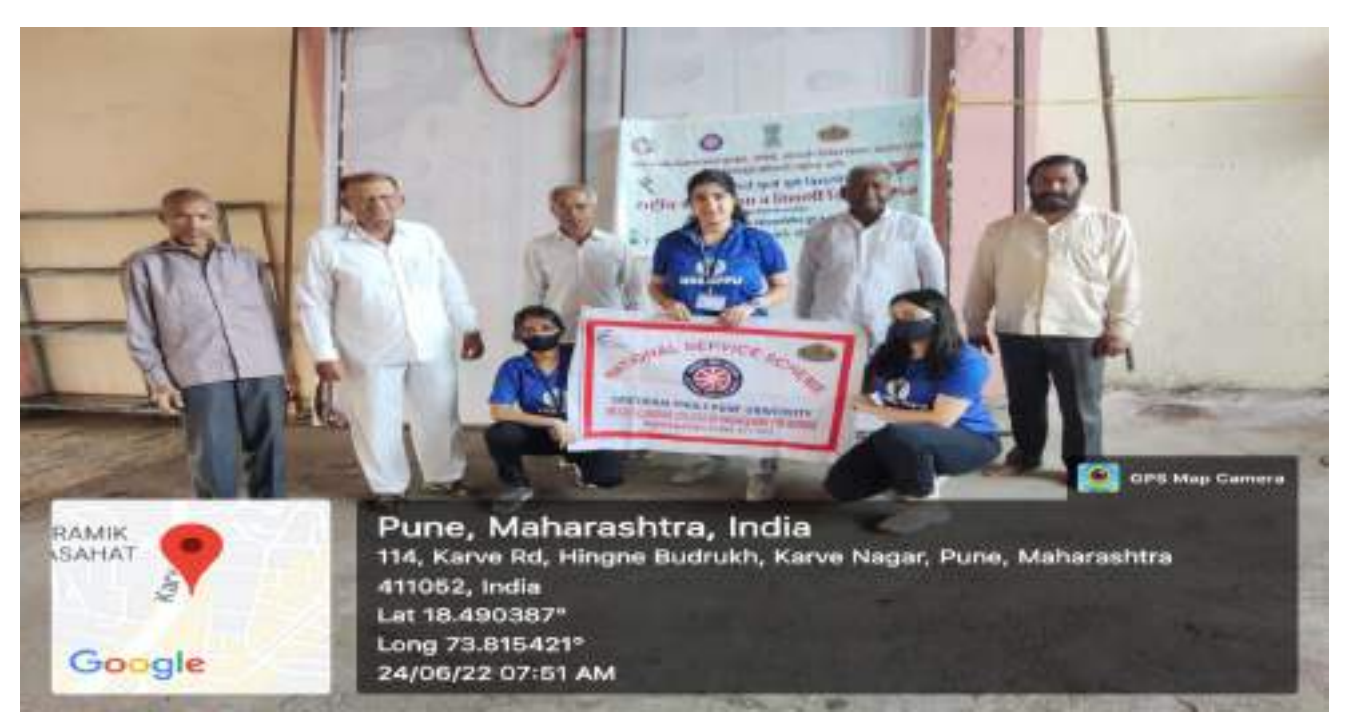
Cummins NSS Team alogwith Local people at Bhairavnath mandir, Karvenagar