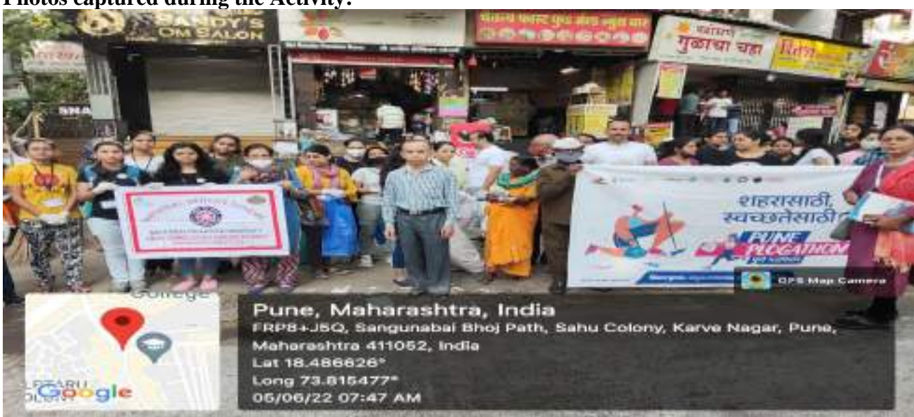
Cummins NSS Team participated in Plogathon-2022 Mega Drive

We all then appreciated by PMC madam for our contribution to the environment and satisfaction and happiness were shining on each of our faces.