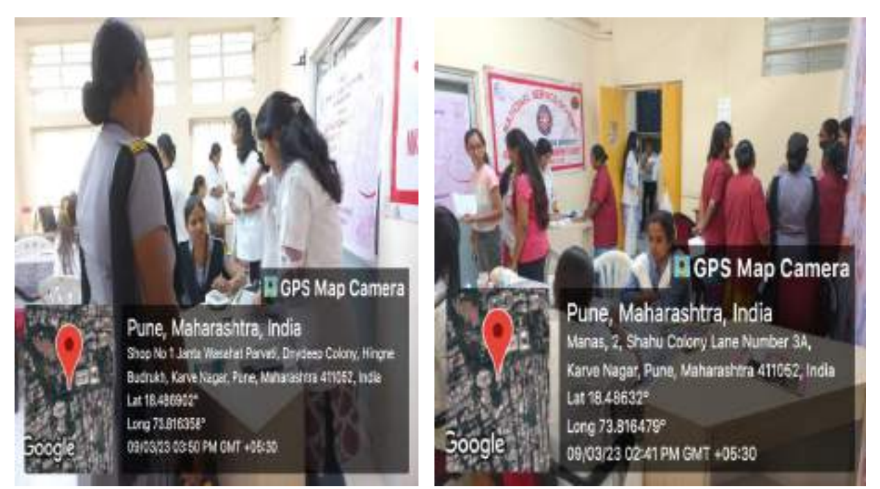
Guard and sweepers staff at Health Checkup

"International Women's Day" celebration gives us the platform to help women empowerment and create awareness on various hygiene practices and prevention from Cancer and how to be healthy. Our NSS volunteers helped to organize this event. They learned many things like coordination, team building, event management and how to keep healthy.