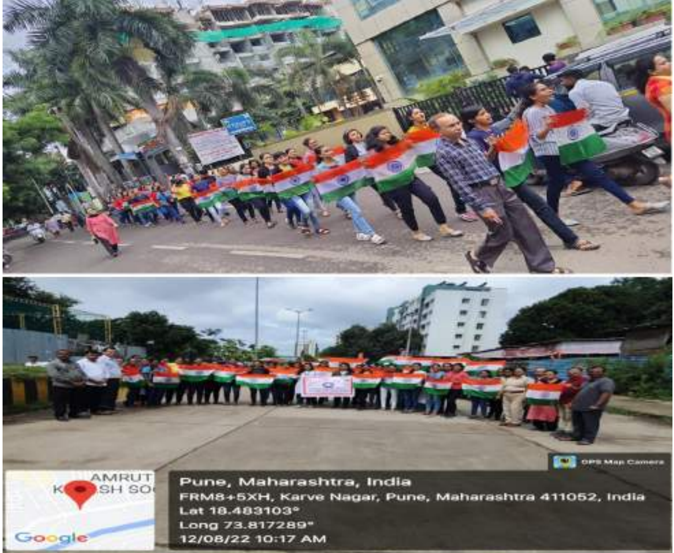
Har Ghar Tiranga Rally from Cummins college and Karvenagar area on date 12/08/2022

In order to keep the memory of the freedom struggle alive in the minds of the people and to keep the spirit of patriotism in the minds of the people forever, to commemorate this glorious history with pride.