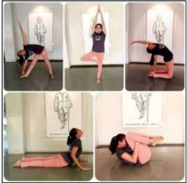
Yoga Poses Challenge Photos