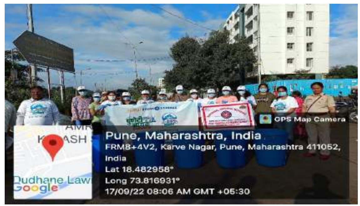
NSS Team of MKSSS'S Cummins College, Pune alogwith Pune Municipal Corporation in Swachh Amrit Mahotsav 2022

The team then participated in the awareness Rally to promote this government initiative.