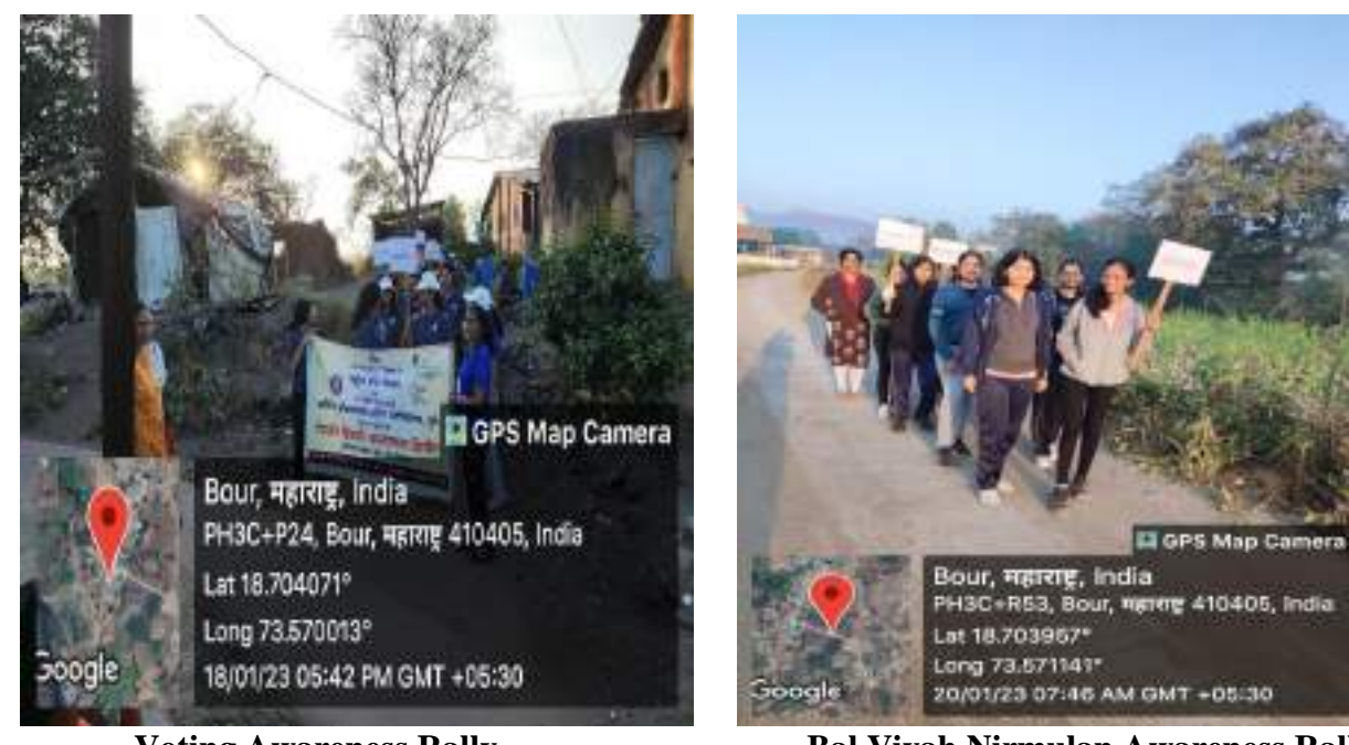
Voting Awareness Rally