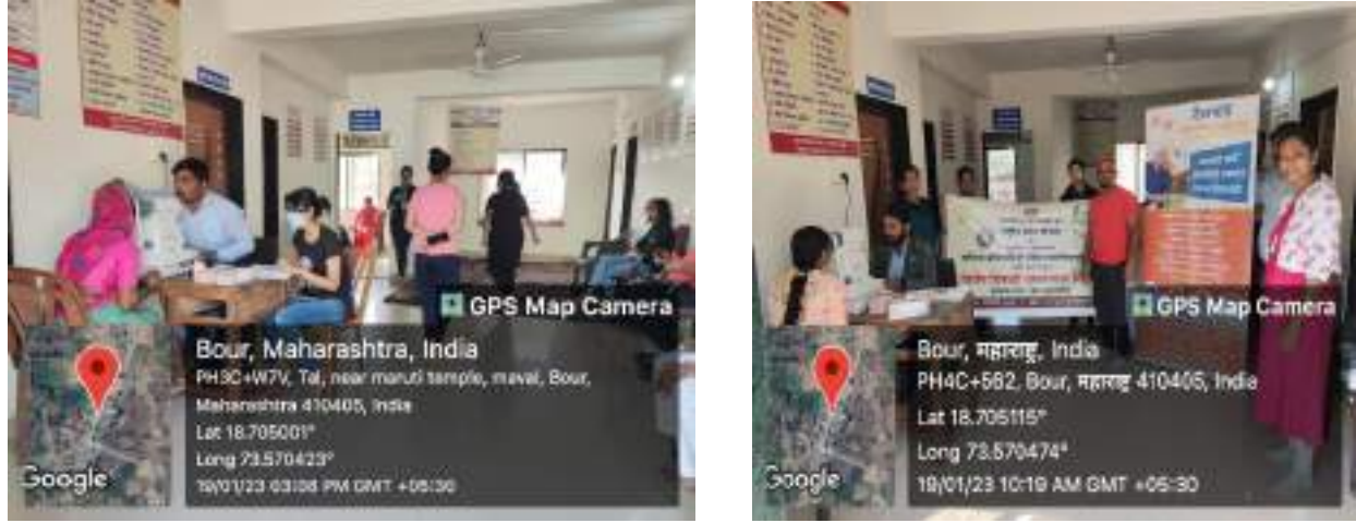
Eye Check-up Camp