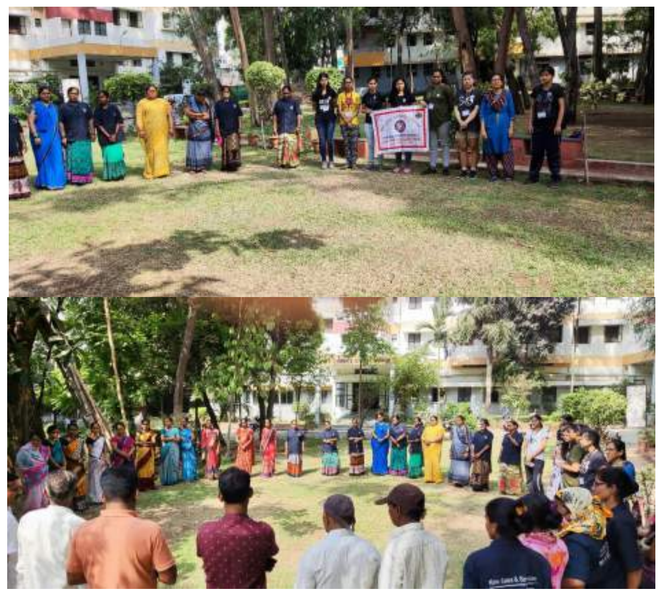
MKSSS's Cummins college of Engineering for Women celebrated World Environmental Day on 5<sup>th</sup> June 2022

We all together took the pledge for protecting the environment on the occasion of world environmental day.