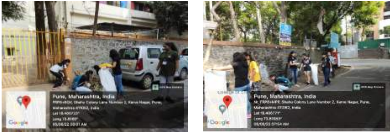
Cummins NSS Team collecting garbage during Plogathon-2022 Mega Drive