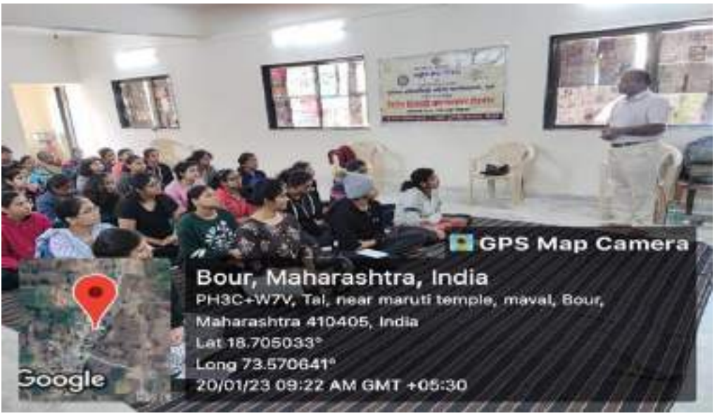
Meditation session by Sahajyog Dhyaan Kendra